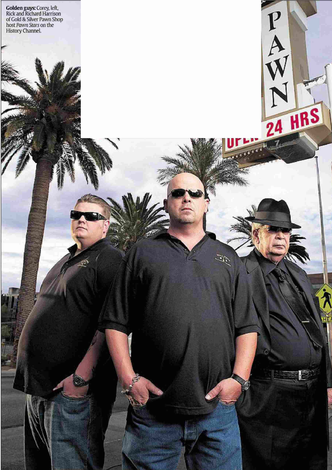
Golden guys: Corey, left, Rick and Richard Harrison of Gold & Silver Pawn Shop host Pawn Stars on the History Channel.